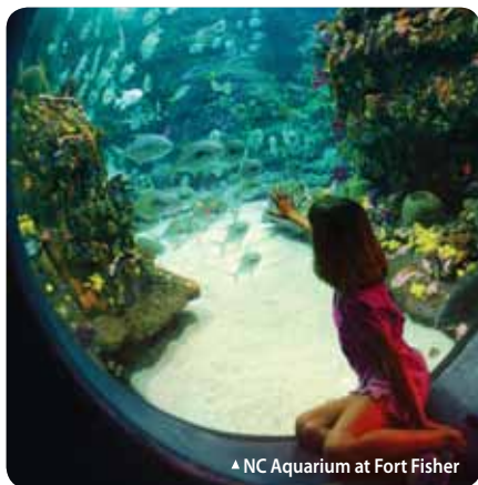
▲ NC Aquarium at Fort Fisher