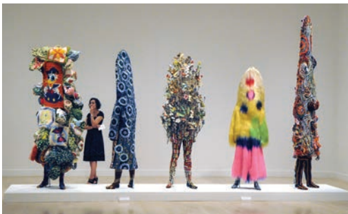
Weatherspoon Art Museum

Area colleges and universities offer a variety of performing arts programs. For more information, see Colleges & Universities on page 22.