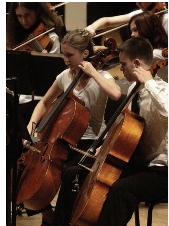
Eastern Music Festival