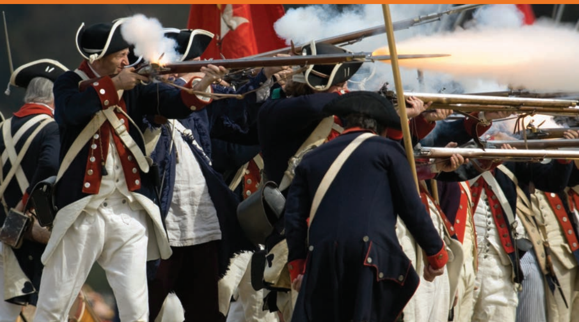
232nd Anniversary Commemoration of the Battle of Guilford Courthouse