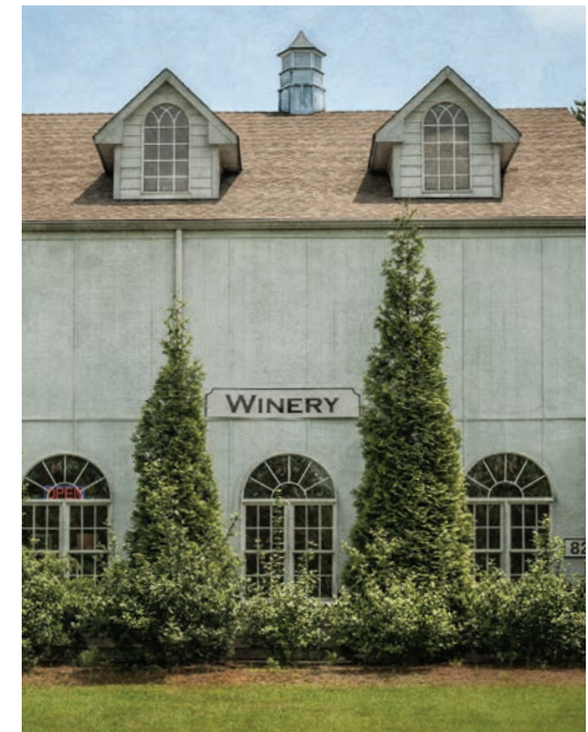
Stonefield Cellars Winery

An award-winning winery that offers the complete wine experience in an accessible and romantic setting just north of Greensboro. On-site tasting room, tours, wine, and gifts. In addition, offsite wine tasting and sales available for groups of 30 or more. Hours: Thurs., Fri., & Sat., 12noon-6pm; Sun., 1-6pm; or by appointment. 8220 NC Hwy. 68 N., Stokesdale. 336-644-9908. www.stonefieldcellars.com