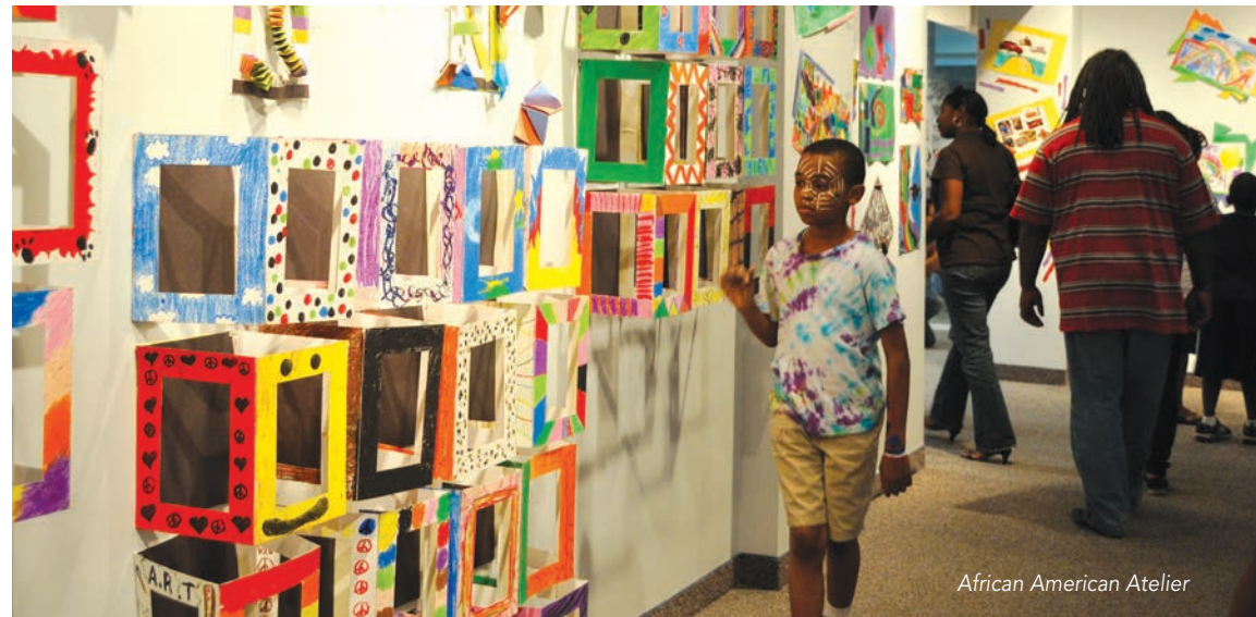
African American Atelier

Nationally recognized for its exceptional collection of 5,600 modern and contemporary art works, and for its dynamic, thought-provoking exhibitions. Well-known artists in the collection include Matisse, de Kooning, Calder, Hesse, LeWitt, Sherman, Warhol and many more. Fifteen or more annual exhibitions are held. Hours: Tues.-Wed. & Fri., 10am-5pm; Thurs., 10am-9pm; Sat.-Sun., 1-5pm. Closed Mon. & university holidays. FREE. On the UNCG campus, corner of Spring Garden and Tate Sts. 336-334-5770. http://weatherspoon.uncg.edu