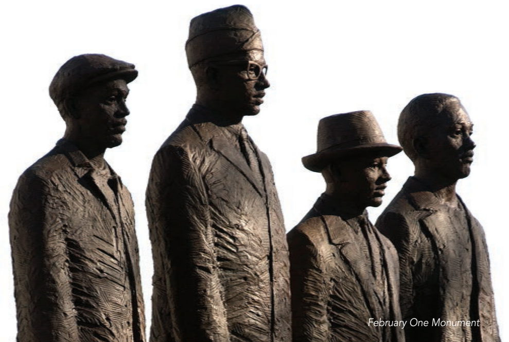
February One Monument

Greensboro traces its origins to people with distinctive cultural backgrounds. Today that influence has multiplied tenfold, as immigrants and refugees arrive from across the state, the nation, and the world. Greensboro's cultural life, public schools, and even restaurants shine with an exciting international hue. Well-known Southern traditions flourish, too.