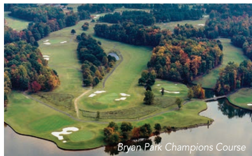
Bryan Park Champions Course

For information about other area sports, including tennis, soccer, basketball and more, please contact the Greensboro Sports Commission. 336-378-4499. www.greensborosports.org . Please refer to the Greensboro Parks & Recreation Dept. website for the location and contact information for the many facilities located in the area ( www.greensboro-nc.gov/leisure ). The area also offers a wide variety of athletic facilities that can be utilized for individual, team and group sports. For more information, please contact the Greensboro Area CVB at 800-344-2282 or visit www.VisitGreensboroNC.com