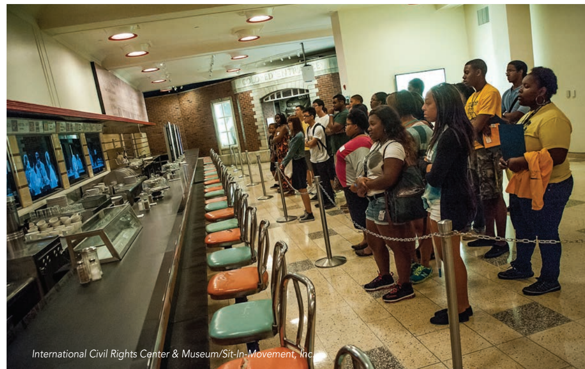
International Civil Rights Center & Museum/Sit-In-Movement, Inc.

Sidewalk markers chronicle six chapters in local African American history ranging from the first fugitive slave on the Underground Railroad to the first African American North Carolina State Supreme Court Justice. FREE. Located on S. Elm St. at February One Place.