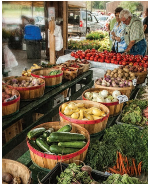
Piedmont Triad Farmers Market

Pick-your-own & pre-picked strawberries. Fresh local pre-picked produce which includes homegrown tomatoes, cucumbers, squash, melons, okra, potatoes, peppers, sweet potatoes and sweet corn. Vegetable plants available in April. Open Apr.-Sept., Mon.-Sat., 8:30am-7pm. 6031 Bethel Church Rd., Gibsonville. 336-697-2473.