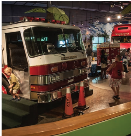
Greensboro Children's Museum

A hands-on, interactive museum for children and their families. Visitors learn while they imagine, touch, create and play in the museum's 20+ educational exhibits and renowned Edible Schoolyard. It's where play is a smart adventure and a tasty one, too! Hours: Mon., 9am - Noon (members only), Closed Mon. afternoon; Tues.-Thurs. & Sat., 9am-5pm; Fri., 9am-8pm; Sun., 1-5pm. Admission fee. 220 N. Church St. 336-574-2898. www.gcmuseum.com