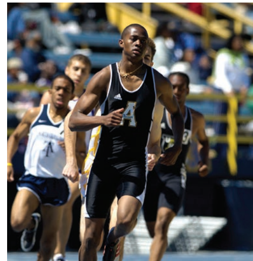
Irwin Belk Track At NC A&T State University

Features the Summit Environmental Education and Conference Center, accommodating up to 200 day and overnight guests in 400 acres of state park. Home to wetlands of the upper Haw River in a natural ecosystem. Park is on the NC Birding Trail. Call for hours. 339 Conference Center Dr., Browns Summit. 336-342-6163. www.ncparks.gov