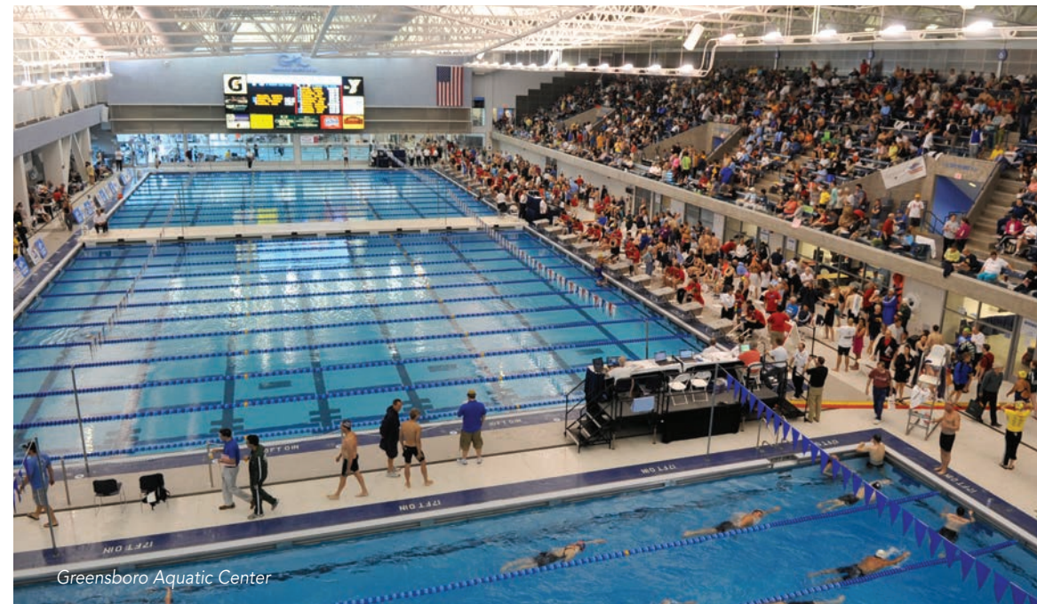
Greensboro Aquatic Center

IAAF certified track is composed of Mondo Super X Olympic style surface. 23,000 seat complex features eight 48" running lanes, dual direction runways for long jump, triple jump, and pole vault...multi-directional high jump and brushed concrete shot and discus circles. Located in Aggie Stadium on the NC A&T campus, corner of Lindsay & Sullivan Sts. 336-334-7141. www.ncat.edu