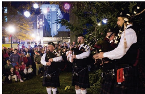
Festival of Lights

The state-wide tour of the NC Dance Festival will visit Greensboro in early November. Enjoy contemporary dance performances by North Carolina artists at Aycock Auditorium on Tate St. Visit website or call for season artists and performance dates. 336-373-2727. www.ncdancefestival.org