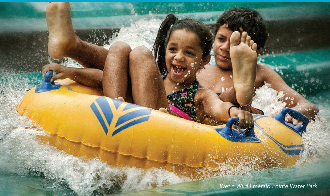
Wet'n Wild Emerald Pointe Water Park