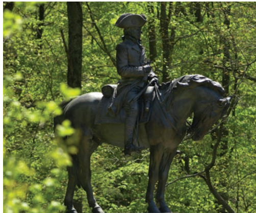
Nathanael Greene statue at the Guilford Courthouse National Military Park